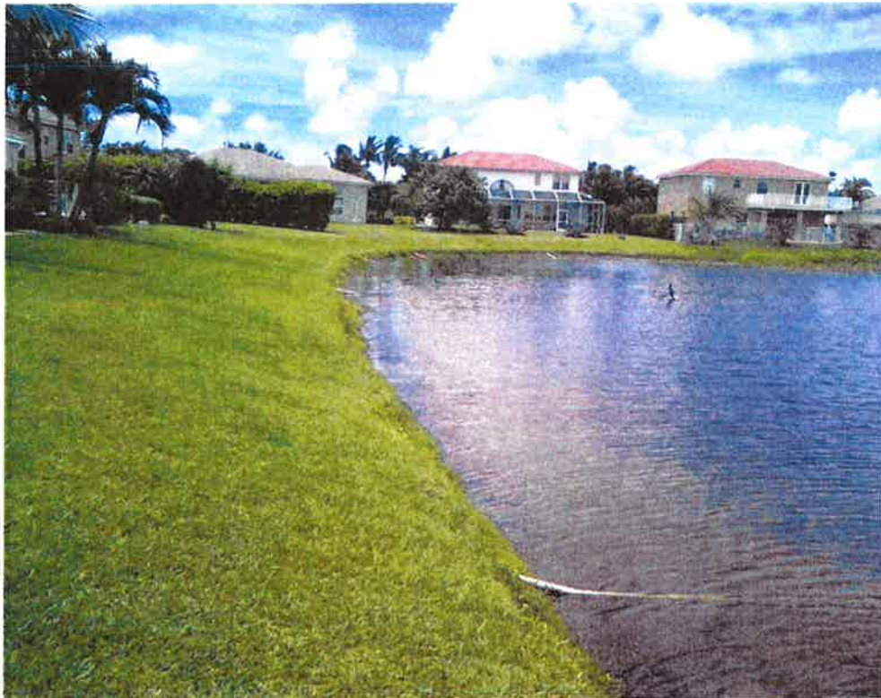
Figure 14 – East End of Lake 5 Looking North on 05/29/2015