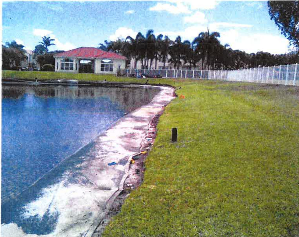
Figure 11 – South End of Lake 3 Looking East on 05/29/2015 – Erosion protection in process of being installed.