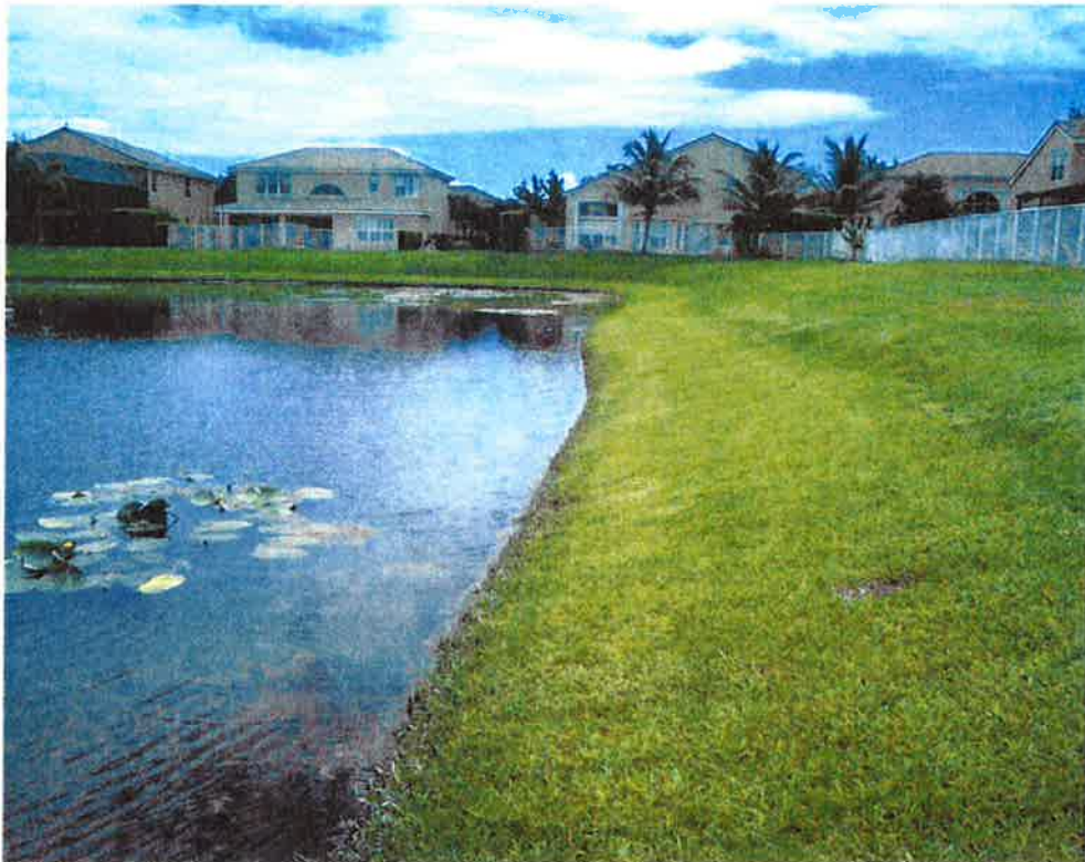
Figure 6 – South End of Lake 3 West of Shadow Creek Village Circle Looking East on 05/29/2015 - Erosion Protection has been completed.