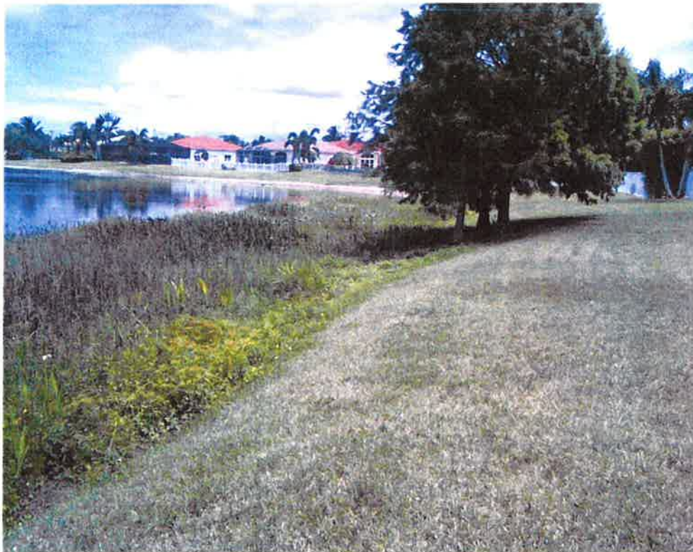
Figure 10 – South End of Lake 3 Looking West on 05/29/2015 – Littoral Zone