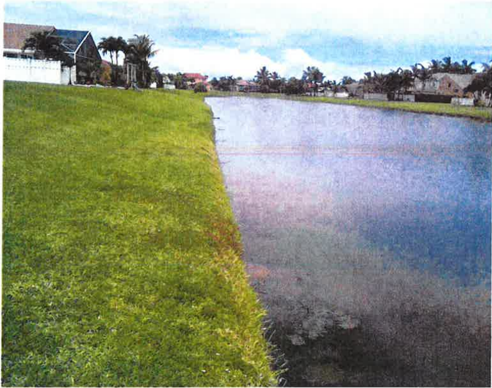
Figure 3 – South End of Lake 2 Looking West on 05/29/2015