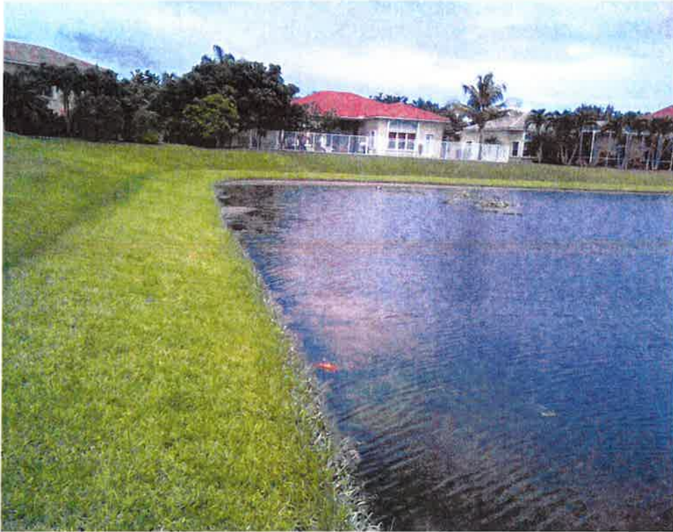
Figure 7 – South End of Lake 3 North of Shadow Creek Village Circle Looking Northeast on 05/29/2015 – Erosion Protection has been completed.