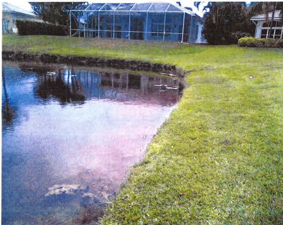
Figure 2 – South End of Lake 1 Looking West on 05/29/2015