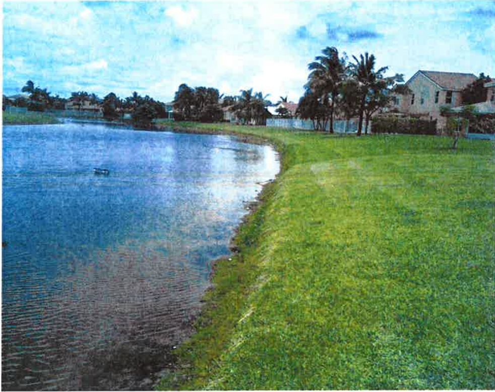
Figure 13 – East End of Lake 5 Looking North on 05/29/2015