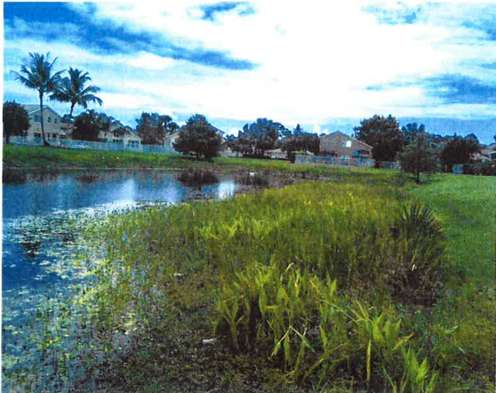
Figure 4 – South End of Lake 2 Looking West on 05/29/2015