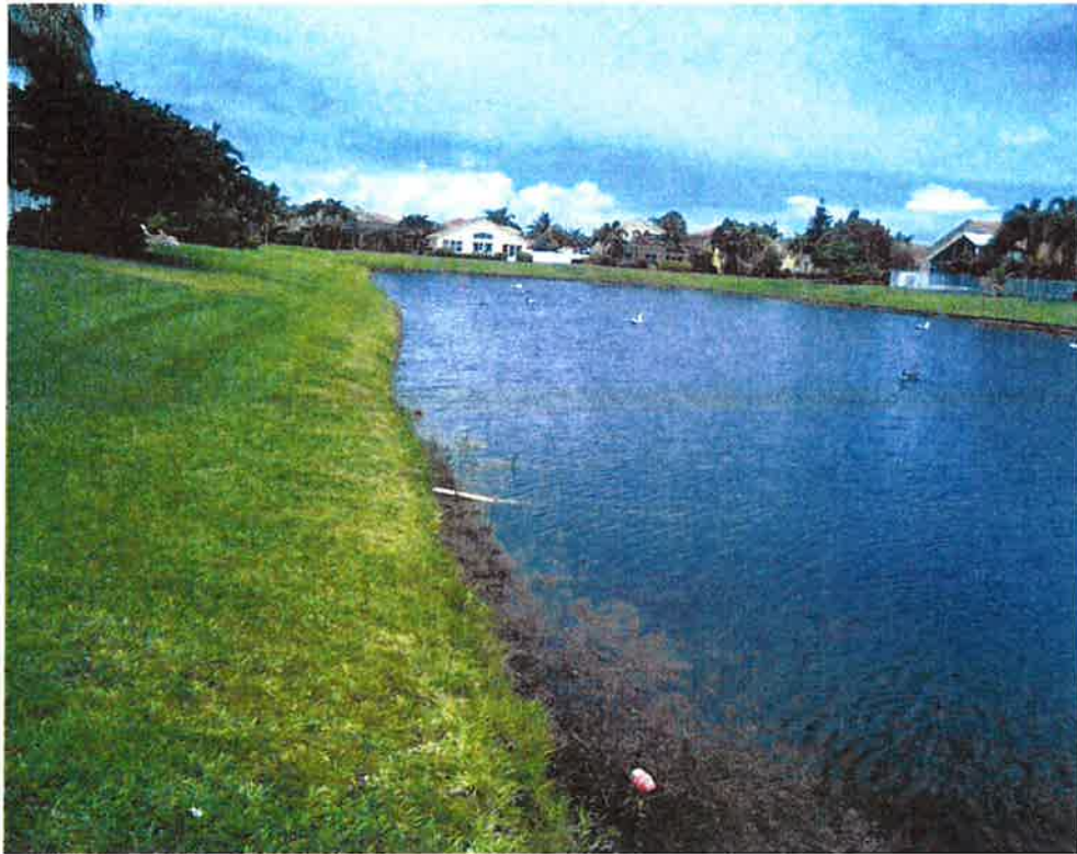
Figure 5 – South End of Lake 3 West of Shadow Creek Village Circle Looking West on 05/29/2015