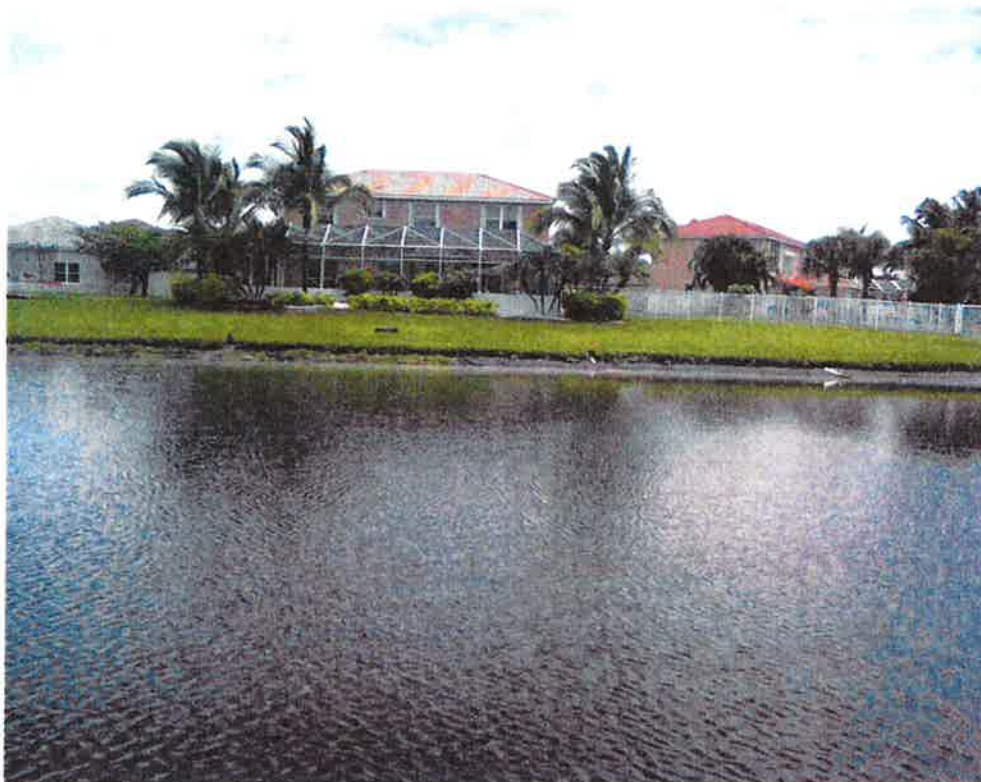
Figure 12 – East End of Lake 4 Looking Northwest on 05/29/2015