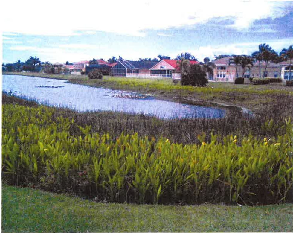
Figure 1 – West End of Lake 1 Looking South on 05/29/15