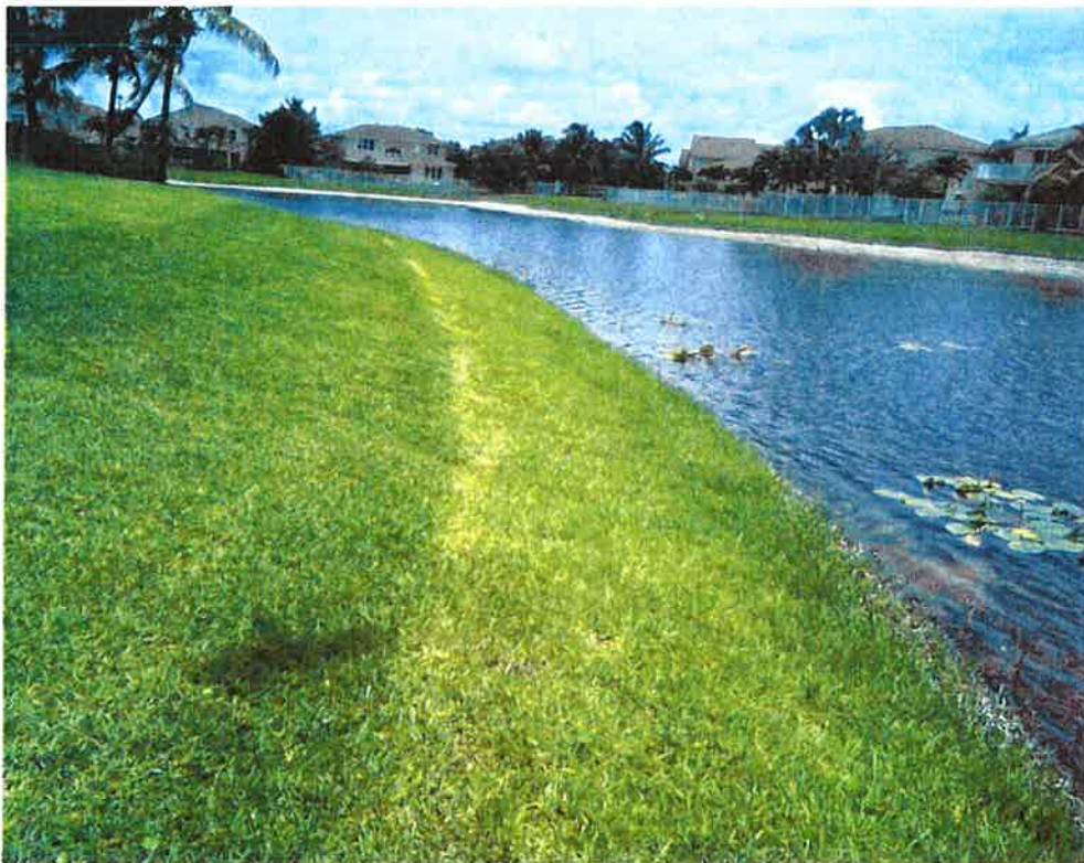
Figure 8 – South End of Lake 3 North of Shadow Creek Village Circle Looking Southeast on 05/29/2015 – Erosion protection has been completed.