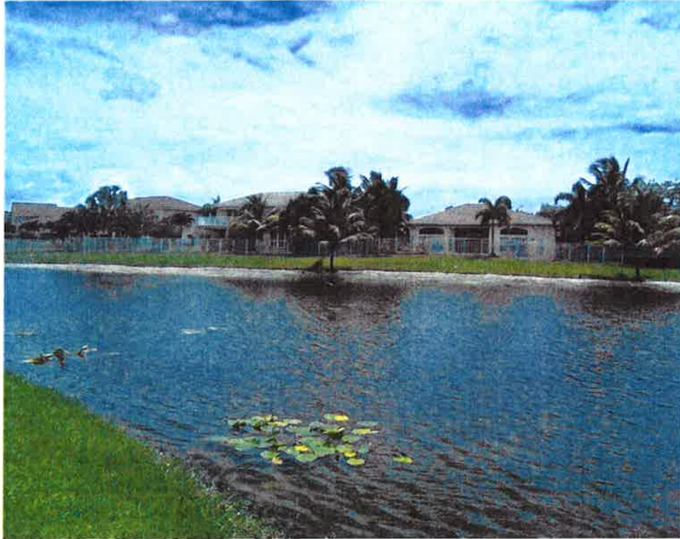
Figure 9 – East End of Lake 3 East of Indianwood Village Lane Looking West on 05/29/2015 – Erosion protection installation on opposite bank ongoing.