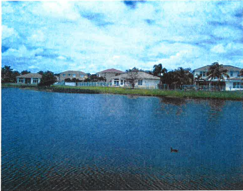
Figure 15 – East End of Lake 5 Looking South on 05/29/2015